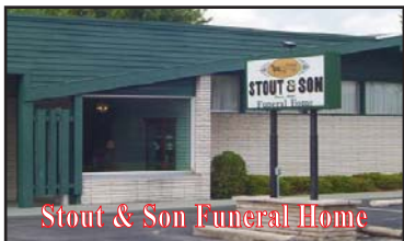
Stout & Son Funeral Home