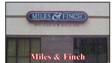
Miles & Finch