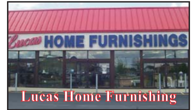
Lucas Home Furnishing