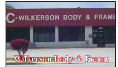
Wilkinson Body & Frame