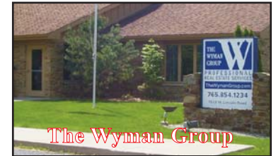
The Wyman Group