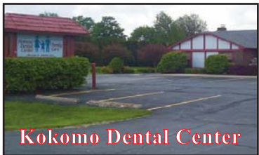
Kokomo Dental Center